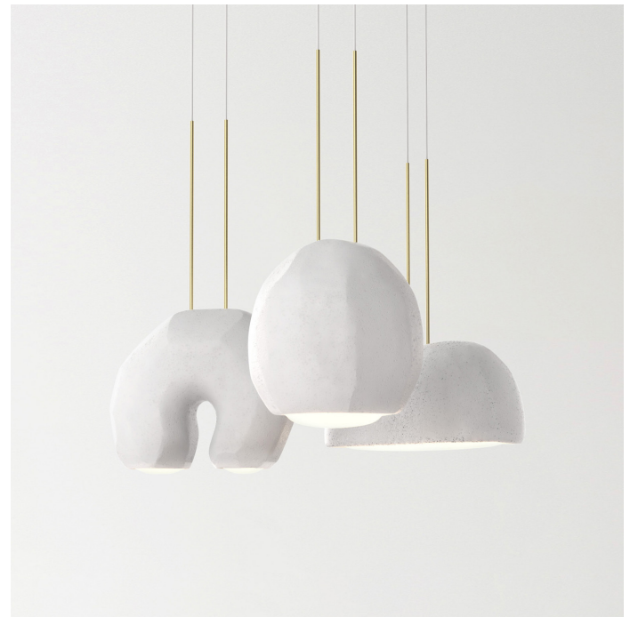
MOONSTONE CHANDELIER CIRCULAR 03

Recommended Light bulbs available on request.