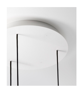
Black Fabric Flex Cable