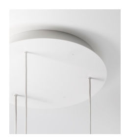
White Fabric Flex Cable